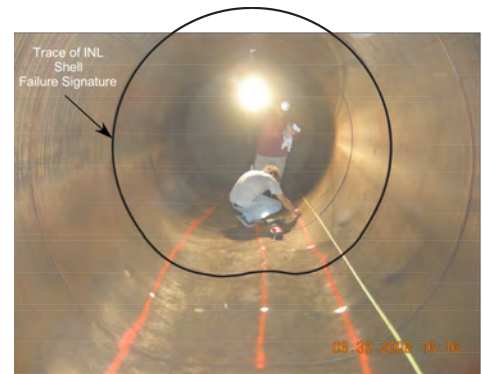
Single-Lobe Tank Failure Inside Tank & Tank Shell Thickness Testing