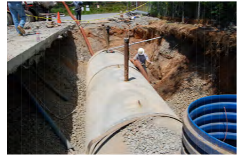
UST Exhumation with Vacuum Truck

The vacuum tank testing company was using maximum vacuum of 4 psi that exceeds the predicted failure vacuum of this tank. The testing company reimbursed the transportation company for re-installation of a new tank, pump island and dispensers.