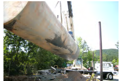
Single-Lobe Tank Failure on UST Bottom