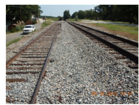
Track After Treatment