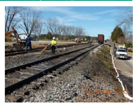
At-Grade Crossing Diesel Release