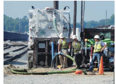
VacuJet™ Heavy Solids Sewer Cleaning System

Email mryckman@remtech-eng.com to receive our news letters, corporate brochure, or white paper HC-2000 Bioremediation Accelerator & Surface cleaner - A Green Sustainable Technology.