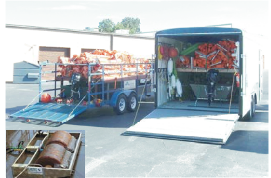
Rapid Deployment Spill Response Trailers (2300 ft boom, boats, skimmers, and spill recovery. (Elastic Drum Skimmer Recovers 97% Fuel)

Since our founding in 1988, we have completed over 4000 environmental remediation projects. Thanks to our many customers, Remtech's facilities and sales have doubled! We have increased our capabilities to include: industrial cleaning & maintenance and pollution prevention systems construction to compliment our flagship environmental remediation & emergency response services.