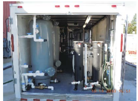
Integrated Total Fluids Extraction & HC2000 Injection System Remediation at UST Diesel Release Site

The last three years for Remtech Engineers have been exciting making us one of the largest inland water response firms in the SE! ... becoming an USGS OSRO Response Contractor; Adding two Guzzler Vacuum Trucks with Hi-rail; invented VacuJet™ (combined jetting & vacuum) heavy solids sewer/pipeline cleaning system capable of cleaning 300 ft sections; constructed pollution prevention facilities for a major railroad in six states; remediated a major speciality chemical fire; investigated, located, and remediated a leaking fuel line under a large intermodal railyard; completed a large diesel fuel groundwater remediation at a major bus terminal with integrated HC2000 injection and total fluids extraction; and stockpiling 2,000 gallons of Remtech's proprietary HC2000 capable of treating impacted shorelines and soils for 4,000,000 million gallons of petroleum hydrocarbon releases.