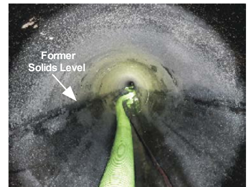
VacuJet™ Removes Heavy Solids from 1,000 ft Wastewater Sewer