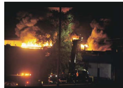
Chemical Plant Fire Response & Restoration