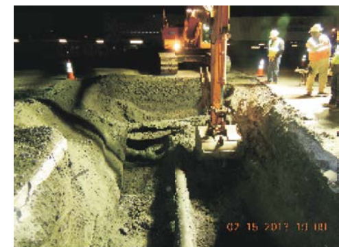
Investigation & Remediation of Major Pipeline Leak at Intermodal Yard